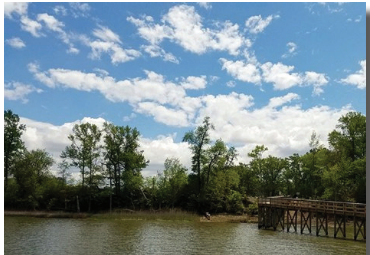
Sleepy Hole Park

" Providing walkable trails in our communities provides excellent opportunities for individuals and families to have a positive quality of health and wellness sustainability"